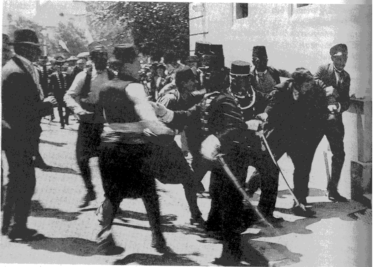
Gavrilo Princip is seized by police, moments after mortally wounding Archduke Francis Ferdinand and his wife.